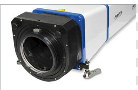
With Surface Isolation Source