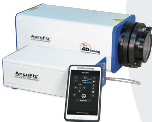
AccuFiz Fizeau Interferometer with Surface Isolation Source