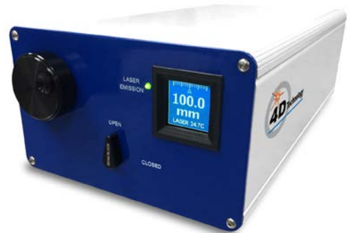
Surface Isolation Source

All specifications subject to change without notice. AccuFiz is a trademark of 4D Technology Corporation. 12.16.16 © 4D Technology Corporation.