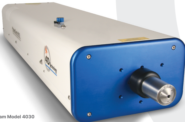
PhaseCam Model 4030